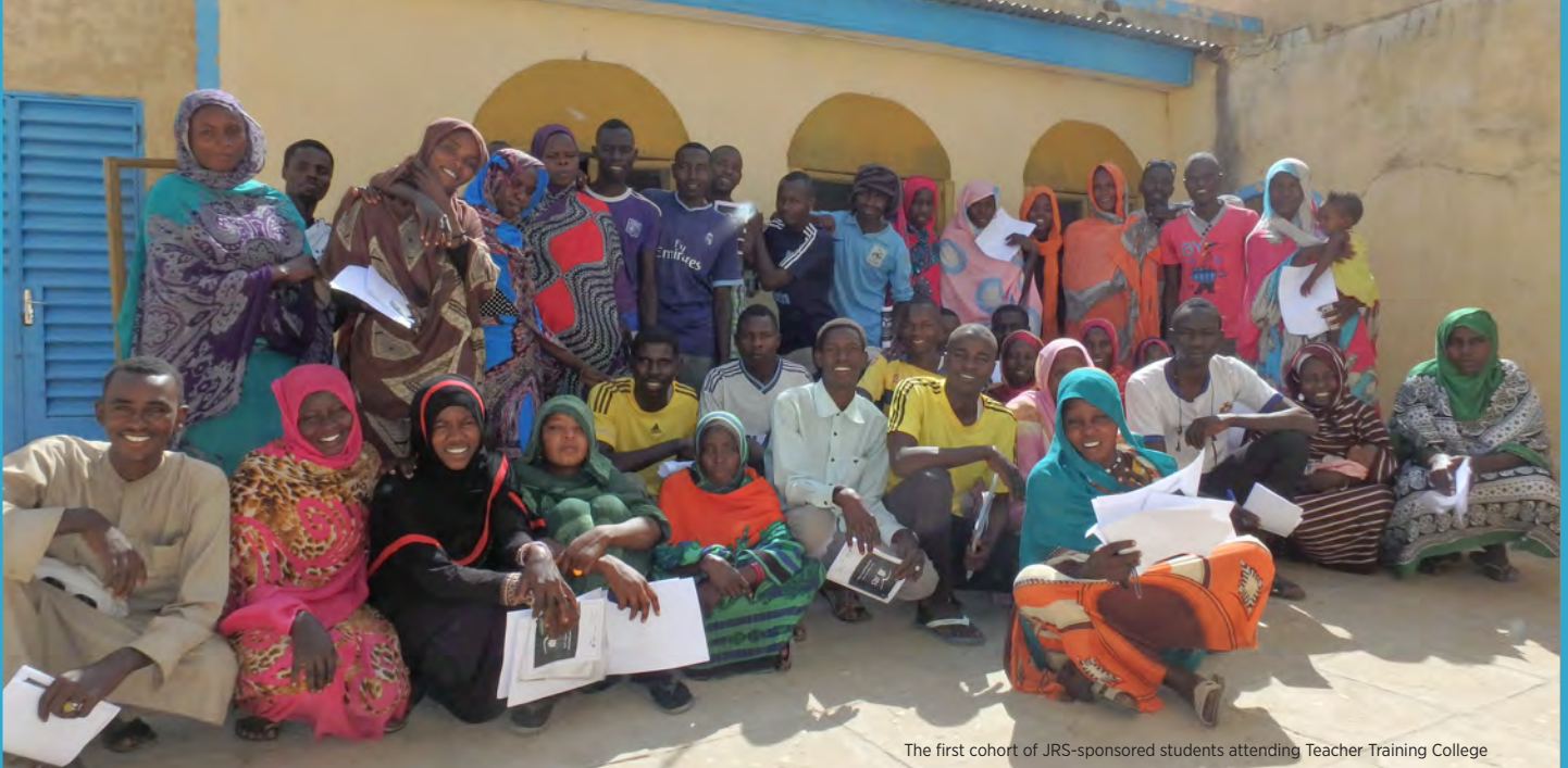
The first cohort of JRS-sponsored students attending Teacher Training College