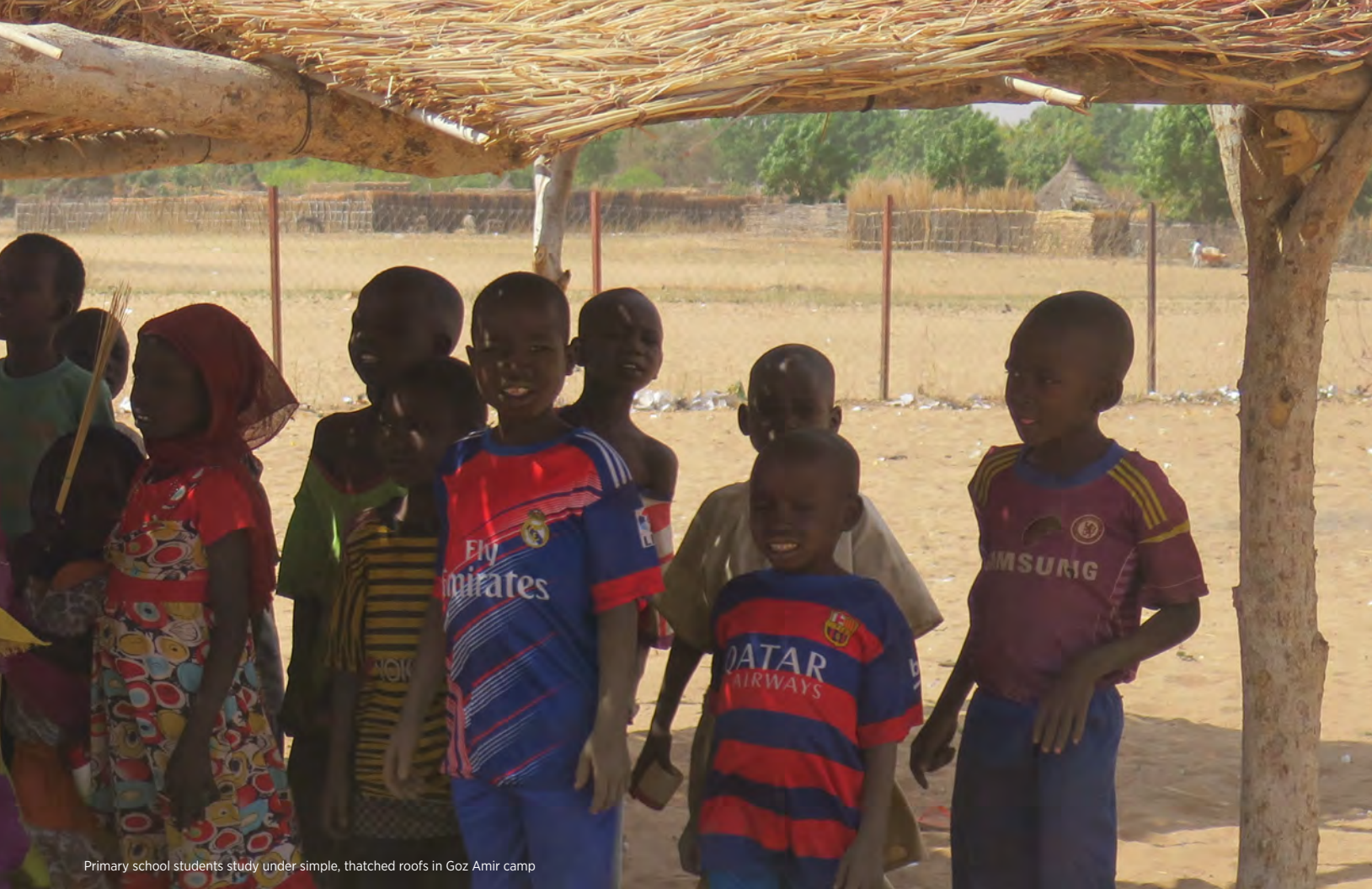
Primary school students study under simple, thatched roofs in Goz Amir camp