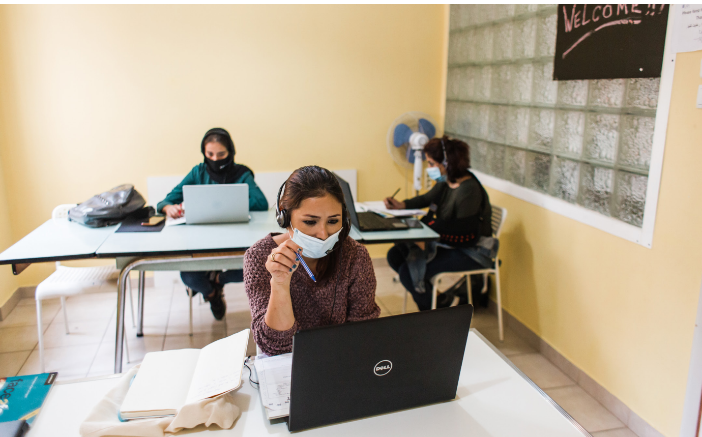
English class at the JRS Greece office in Athens. Due to the COVID-19 pandemic, the classes are online on computers provided by JRS.