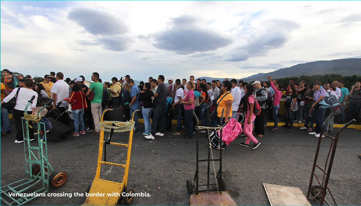
Venezuelans crossing the border with Colombia.

While JRS welcomes Colombia's recent announcement that it will grant temporary protection status for 10 years to 1.7 million Venezuelans, allowing formerly undocumented migrants and asylum seekers to work legally in Colombia, there is more to be done. "Colombia's ability to respond effectively to asylum requests needs to improve. Asylum applicants must be offered protection, and Colombia must move towards the widespread recognition of refugee status for Venezuelan forced migrants," commented Astrid Rivera, a member of the legal team in the Arauca-Apure Binational Office, JRS Latin America/Caribbean Regional Office.