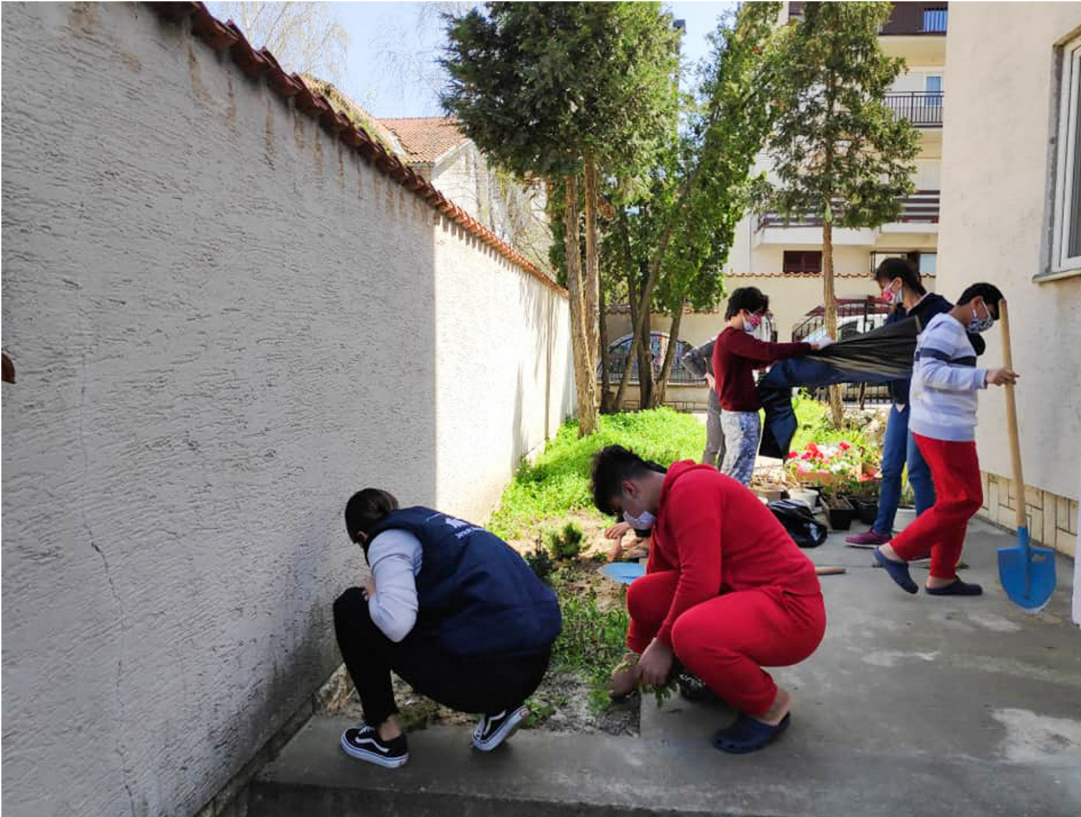
Gardening at the Pedro Arrupe integration house for unaccompanied refugee minors in Serbia in April 2020.