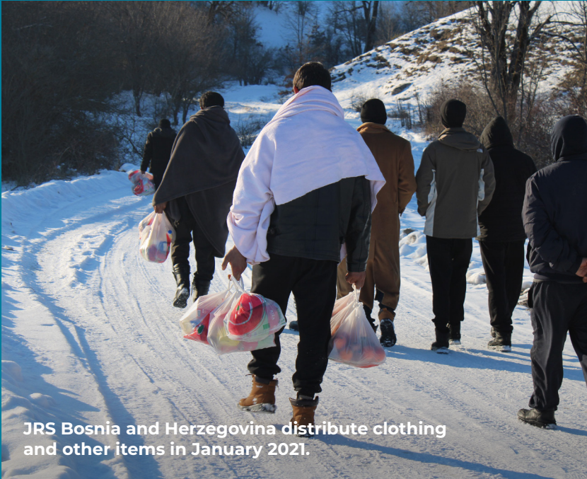
JRS Bosnia and Herzegovina distribute clothing and other items in January 2021.