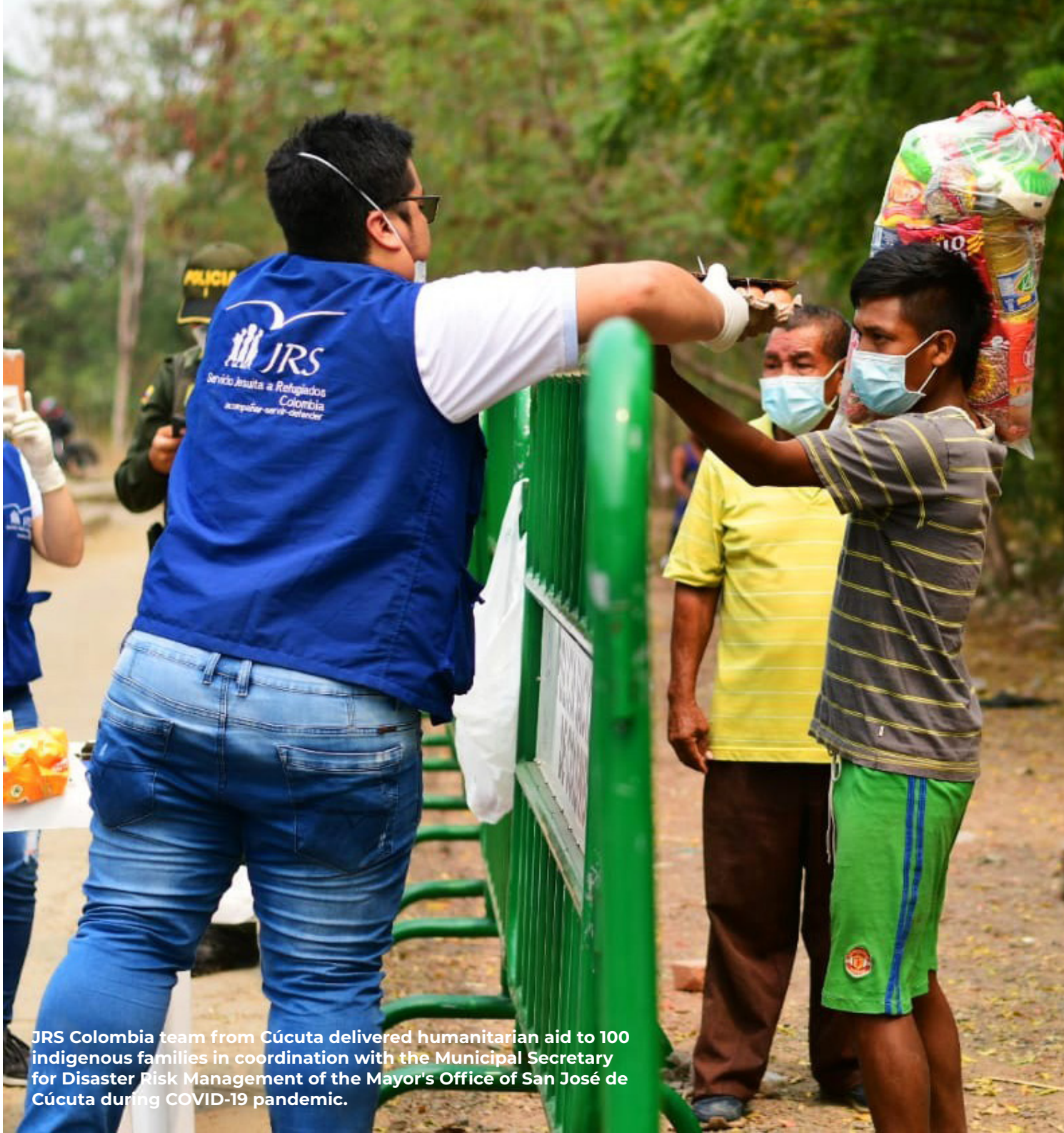
JRS Colombia team from Cúcuta delivered humanitarian aid to 100 indigenous families in coordination with the Municipal Secretary for Disaster Risk Management of the Mayor's Office of San José de Cúcuta during COVID-19 pandemic.

As of March 2021, there are still 57 countries where access to territory is denied with no exceptions for asylum seekers .