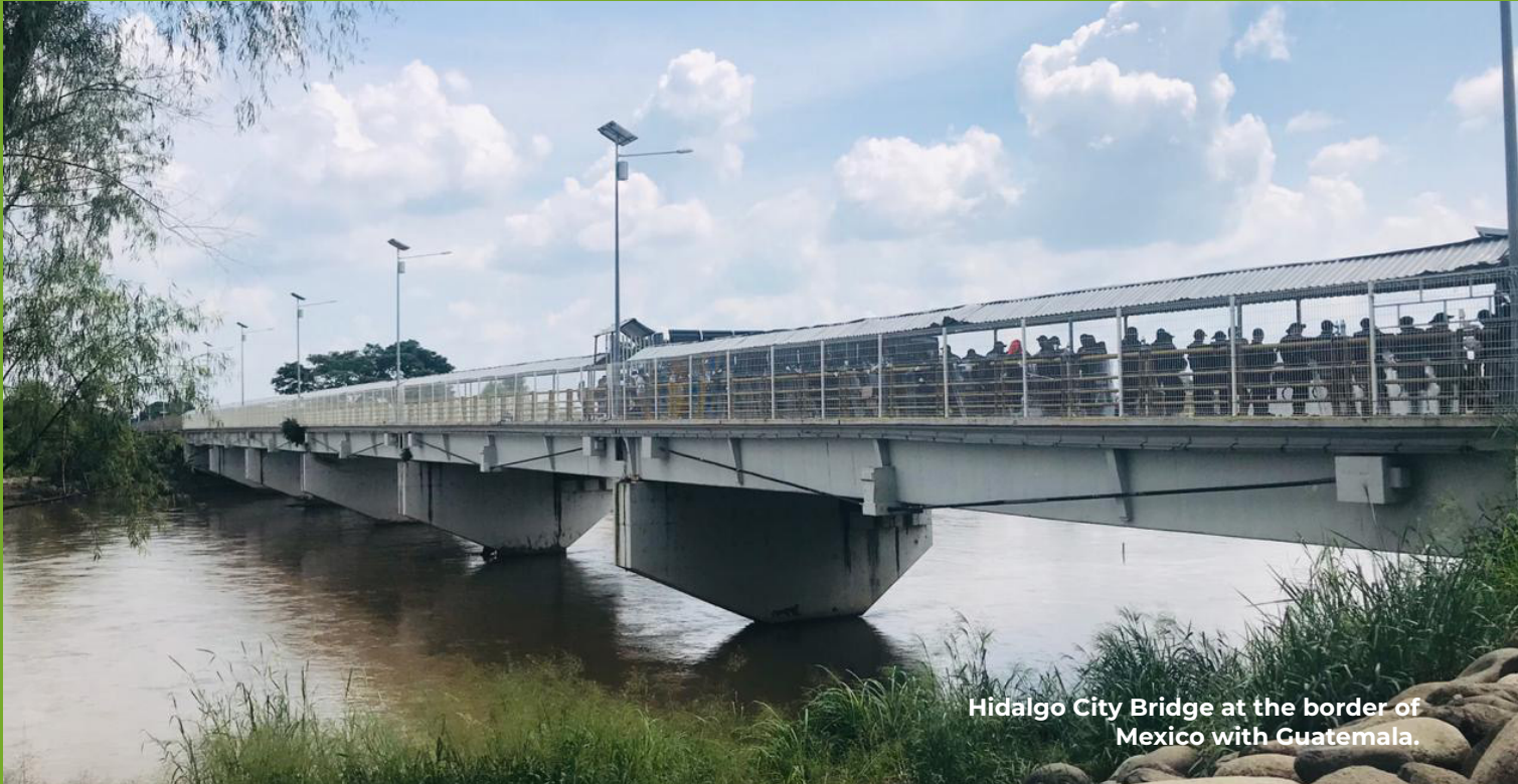
Hidalgo City Bridge at the border of Mexico with Guatemala.

government received 41,329 asylum applications from individuals representing 80 countries, a 42 percent decrease from 2019.