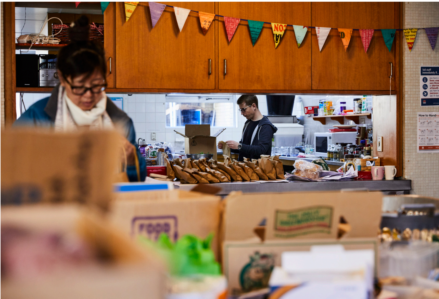
JRS Australia volunteers ration rice and sugar for food deliveries.