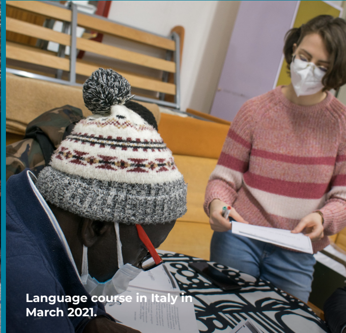
Language course in Italy in March 2021.

Research conducted by JRS in several EU countries found that the COVID-19 crisis has magnified and aggravated pre-existing flaws in asylum systems across Europe. Before the pandemic, the reception of asylum seekers had been insufficient, and even inhumane, in many countries.