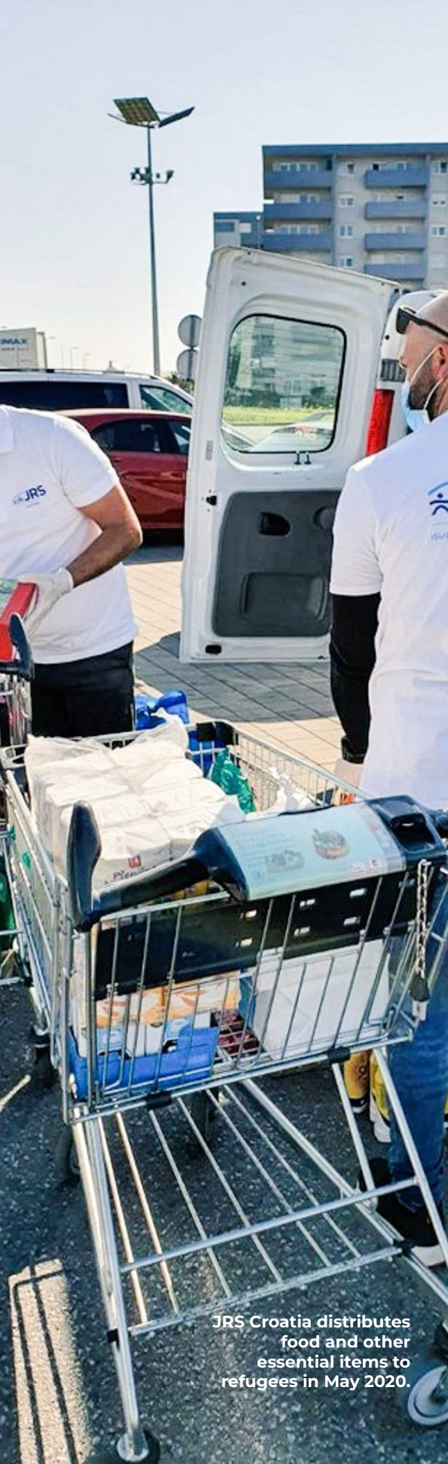
JRS Croatia distributes food and other essential items to refugees in May 2020.

In response to the initial outbreak of COVID-19 in early 2020,