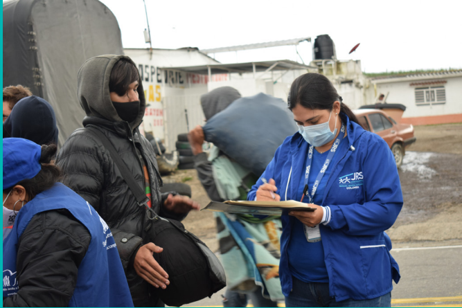
JRS helping Venezuelan Asylum seekers in Norte de Santander, Colombia.