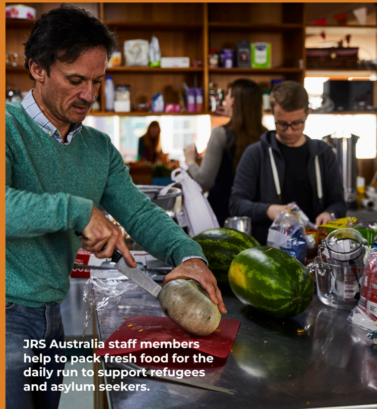
JRS Australia staff members help to pack fresh food for the daily run to support refugees and asylum seekers.

The future for people seeking asylum in Australia is uncertain. There are thousands of people seeking asylum who have already waited years for their claims to be resolved. There are also increasing numbers of recognized refugees, previously granted forms of temporary protection, whose visas are expiring and who are going through complex and onerous reassessment procedures. 50